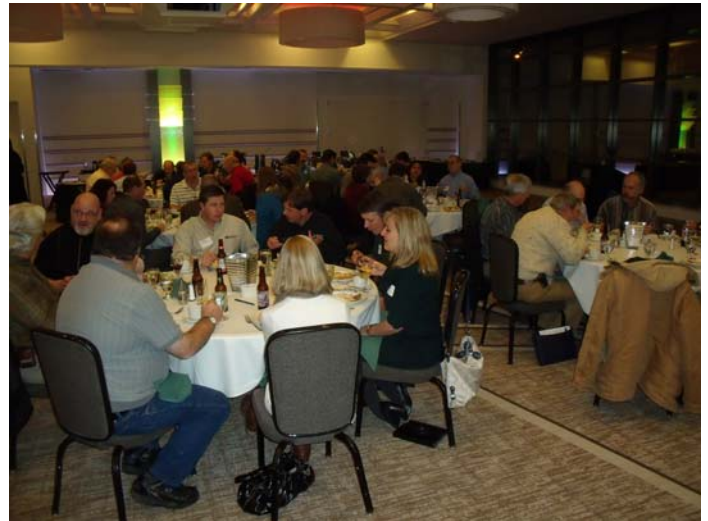
Members enjoying dinner before the technical presentation.

The Michigan Section held its annual meeting on December 5, 2013 at MSU's Kellogg Center in East Lansing. Approximately 50 members and students attended the meeting.